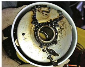
A filter clogged up with nasty diesel sludge

If reliance on a tank is great, it is important to prevent the bugs in the fuel from settling as this is when they become a problem. Enter the CTS Fuel Polisher.